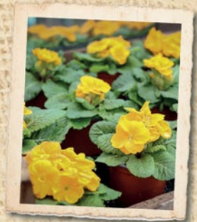
Bedding plants and hanging baskets