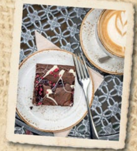
Visit our Primrose Cafe open 7 days a week