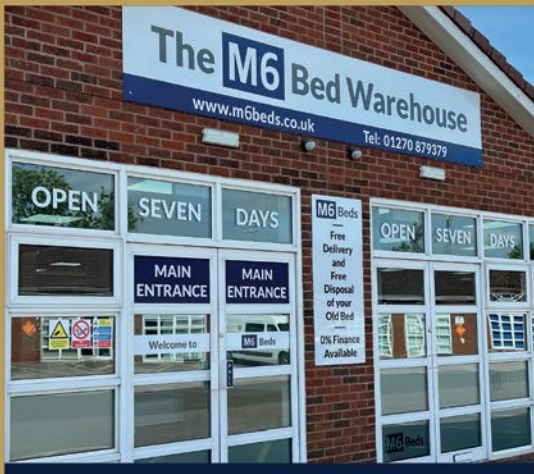
ALSAGER STORE RADWAY GREEN BUSINESS PARK - CW2 5PR