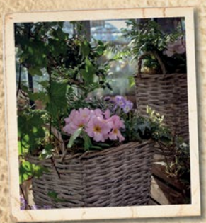
Wide range of plants, trees and shrubs

Come and visit our knowledgeable and friendly team at Primrose Hill Nurseries where we have an abundance of stunning plants and shrubs grown on site at Primrose.