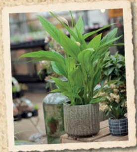
Indoor houseplants and gifts