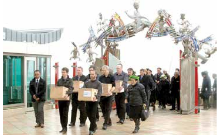
Toi mokus arriving in New Zealand

It is not known how the Toi moko came to be in Warrington