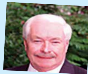
Lord Doug Hoyle