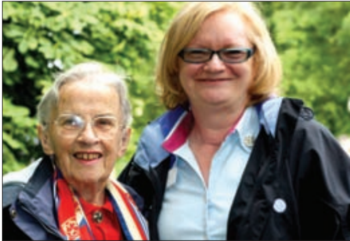
GIRL Guides from Culcheth 'took over' part of Culcheth Linear Park to celebrate the centenary of Girlguiding - and present a veteran Girlguider with an award.

A heron carving was unveiled to mark the occasion.