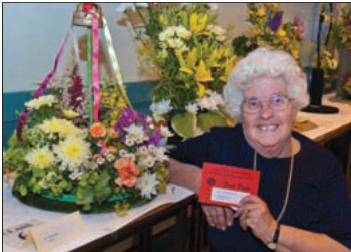
CULCHETH & District Horticultural Society held their annual show at Newchurch Parish Hall.