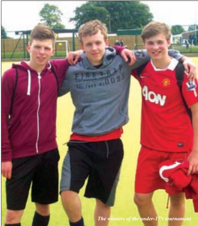
The winners of the under-17's tournament