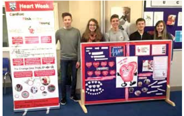
Student charity ambassadors at Appleton College – the Sixth Form at Bridgewater High School – helped with the marketing for the event.

STUDENTS and staff at Bridgewater High School and Appleton College were encouraged to “change one thing” as part of a fundraiser for Cardiac Risk in the Young (CRY).